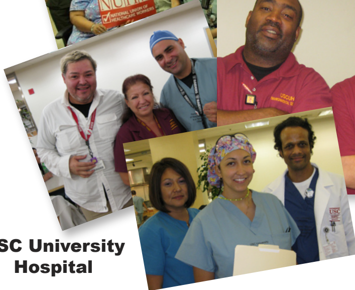
USC University Hospital