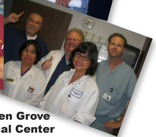
Garden Grove Medical Center

“All of us are sticking together in NUHW, its the same people we have worked with for years. The people who negotiated our contracts, and the people we know and we trust. We are VOTING NUHW!!!”